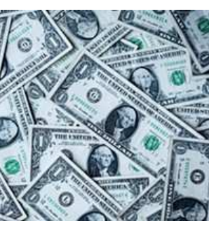
Bend Man Wins Megabucks Jackpot Sep 13, 2019