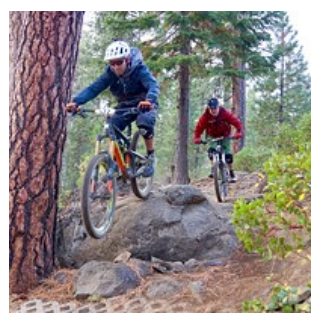
An Uphill Battle Oct 2, 2019