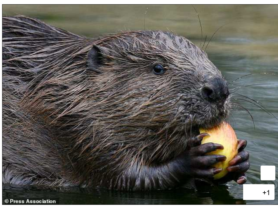
Beavers will be given the protected status from May 1

All licences will be issued in accordance with the law on European Protected Species.