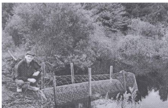
Figure 3. Beaver baffle

If the level of backed-up water is not important, no additional work is needed except for periodic maintenance checks. More often, however, pre-dams are used in combination with drain pipes in order to control water levels upstream.