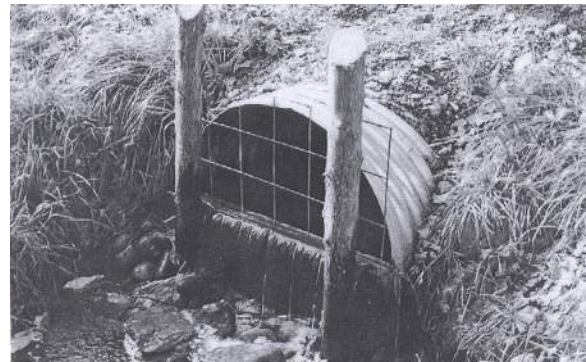
Figure 4. Dam board on culvert outlet

Such dams can be prevented by installing 5-in. mesh wire fencing that is held in place with two fence posts at culvert outlets. A 10- to 12-in. opening should be left for wildlife passage in high-traffic areas or at road embankments with steep slopes. Dam boards may also be installed at culvert outlets to control the water level upstream and to preserve part of the upstream wetland (Figure 4). A 2-in.-thick board can be secured to the outlet of a small culvert with fence posts, or a sheet of plywood can be used at the outlet of larger culverts. Dam boards are removed during flood periods or at important fish migration times. The boards also quiet the noisy flow through metal culverts that can stimulate beaver activity.