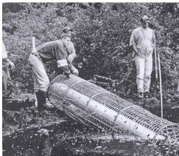
Figure 5. Clemson leveler intake pipe

Some form of protection at the intake will be necessary to prevent beaver clogging. Perforated pipes can be capped at the intake or a protective 3-ft-diam roll of 5- or 6-in. mesh fencing, closed at the upstream end, can be added to prevent blockages (see “A Step by Step Guide to Solving Beaver Problems” (The Fund for Animals 1999)). Elbows can be added to both ends of non-perforated pipes. Pipes should be slanted slightly downward from the control box or culvert to ensure that their inlets are underwater. This reduces the sound of flowing water that can stimulate damming. At least 3 ft of clearance from a pipe to the pond bottom is preferable, especially if the substrate is soft. Pipes can be cleaned with a telescoping rod of the type used to clean chimneys.