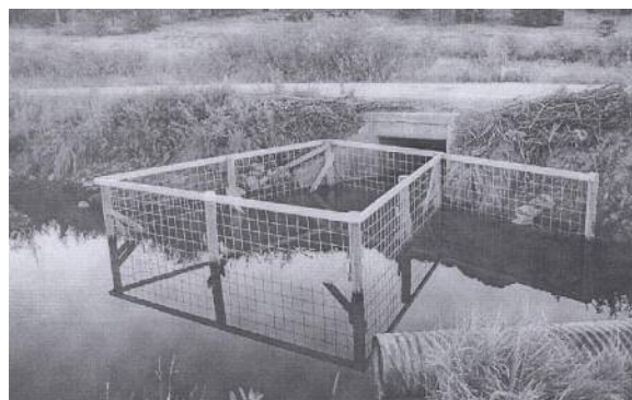
Figure 1. Beaver Deceiver

Beaver Deceiver. A beaver deceiver (Figure 1) is a fence that discourages damming due to its unnatural shape and large perimeter (Lisle 1999). Deceivers are usually trapezoidal, but may be pentagonal or form long rectangles at narrow flowages. Fences are constructed of braced cedar posts and 6-gauge, wide mesh fencing. Although heavy-duty metal posts could also be used, wooden posts appear to be more resistant to ice damage and vandalism. The bottom of the fence should fit tightly against the streambed. If a deceiver is built in a flowage with a soft or uneven bottom, beavers can be discouraged from digging underneath by placing strips of fencing secured with concrete blocks in an "L" pattern, facing outward around the perimeter.