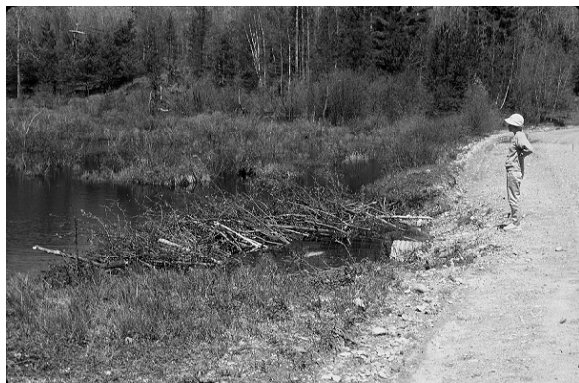
Figure 2. Pre-dam installed at culvert intake

is often used, because it is readily available in 100-ft-long, 5-ft-wide rolls, or 5- by 10-ft sheets, and the larger mesh size allows for less obstruction of water flow and debris accumulation than 5-in. mesh. An occasional beaver, however, will become stuck in the 6-inch mesh; beaver entrapment is less apt to occur with the smaller mesh. The fence should extend about 2 ft above the water level or a cover should be added to discourage climbing beavers. To further protect the water control structure, beaver sticks and other debris can be placed against the fence to encourage the beavers to dam the fence instead of the water control structure. For culvert installations, a minimum radius of 7 ft is recommended for an 18-in. culvert with a correspondingly larger radius for a larger culvert. At sites that are adjacent to high traffic roads or have steep banks, it is advisable to leave a 10- to 12-in. opening, or similarly sized passageway along a 5-ft-long “wing” at one side of a pre-dam or beaver deceiver to allow wildlife passage.