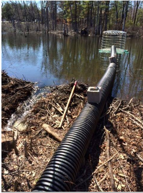
Pond Leveler Being Installed, Rangeway Rd.