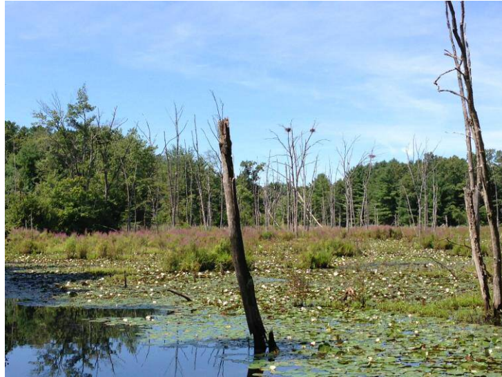
Billerica Beaver Created Heron Rookery

The use of flow devices at 43 sites in town has prevented the trapping of 38 beaver colonies. In Billerica these 38 beaver colonies create an average of 10 wetland acres with their dams, or 380 total wetland acres that would not exist if the beavers were trapped. Estimates vary but ecological value of freshwater wetlands can conservatively be valued at over $5,000 per acre per year. 4 Therefore the untrapped beavers are providing the town with approximately $2,000,000 of free ecological services every year, and over 35 million dollars in ecological services since the inception of the program.