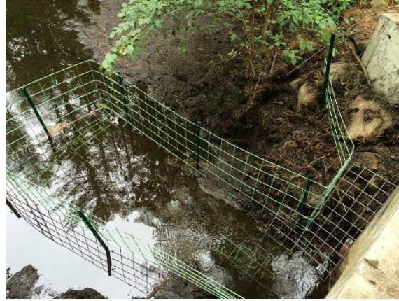
Billerica Culvert Fence w/ Wildlife Passage

Within 3 years the BMBMP was successfully managing 35 conflict sites with flow devices, and 7 sites with trapping. The trapping sites were classified as "No Tolerance Zones" for beaver damming because flow devices had either failed or were not feasible at these locations.