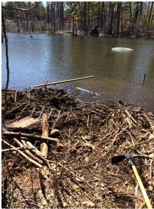
Pond Leveler in Beaver Dam, Rangeway Rd.